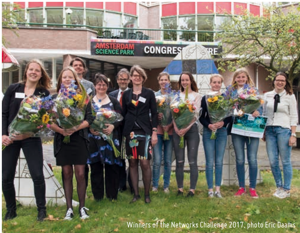
Winners of the Networks Challenge 2017