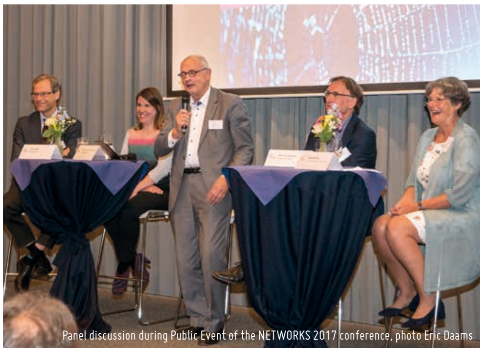
Panel discussion during Public Event of the NETWORKS 2017 conference

The conference concluded by another two parallel tracks with scientific presentations. The first of these tracks focused on com-