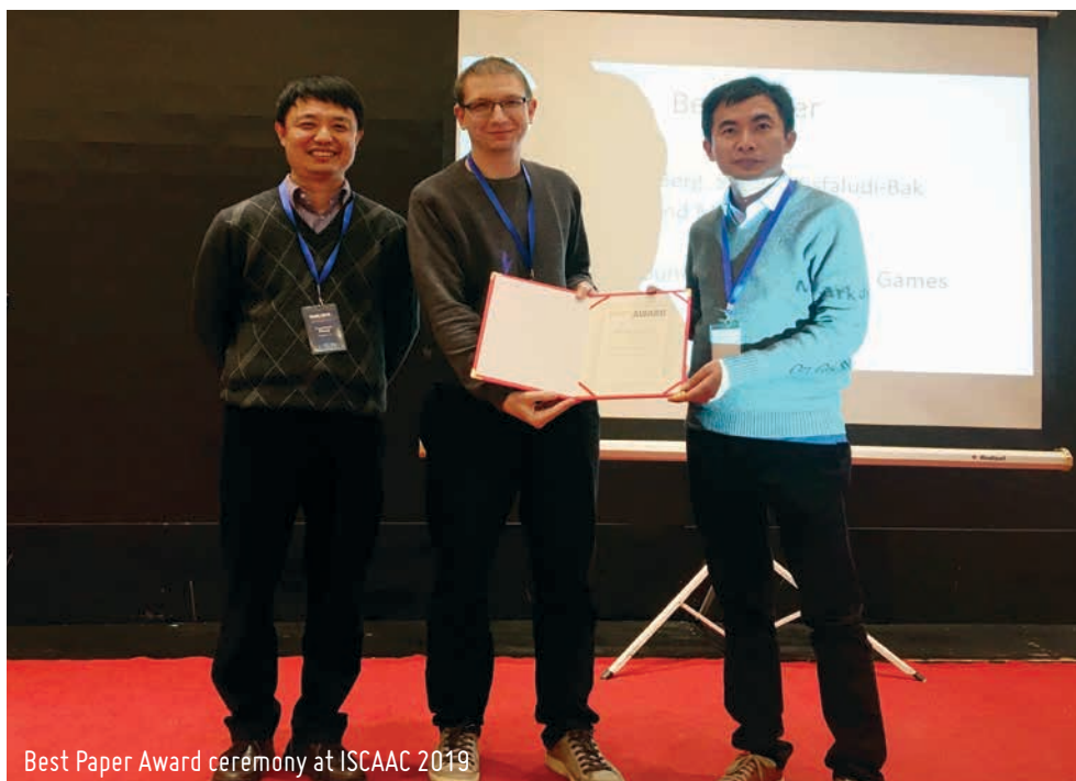
Best Paper Award ceremony at ISCAAC 2019